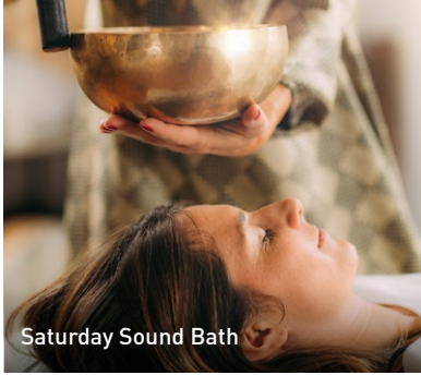
Saturday Sound Bath