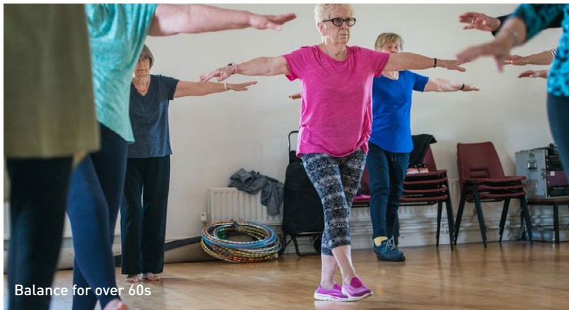
Balance for over 60s