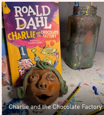
Charlie and the Chocolate Factory

Friday 29 May, 9:30am - 3pm £40 full/ £70 twins/siblings