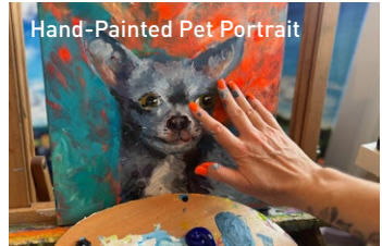
Hand-Painted Pet Portrait