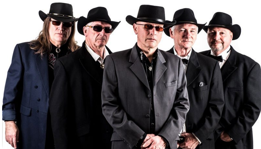
The Unravelling Wilburys

Featuring a powerhouse lineup of blues veterans and award-winning musicians, Third Degree delivers an infectious, high-energy mix of R&B, jump jive, and modern soul that is guaranteed to get audiences dancing.